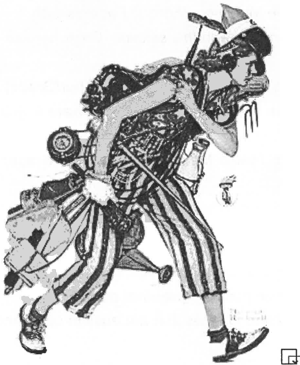
“Rosie to the Rescue,” Norman Rockwell (Saturday Evening Post: September 4, 1943)