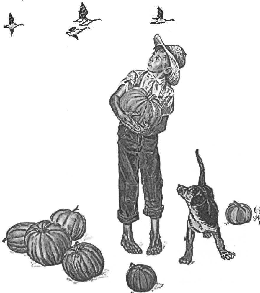
"Autumn Harvest," Norman Rockwell (Hand-Pulled Lithograph, July, 1977)