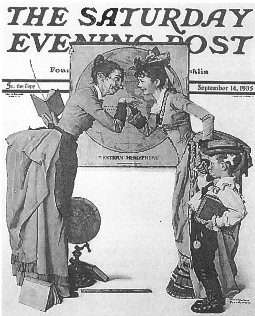
"First Day of School," Norman Rockwell (Saturday Evening Post: September 14, 1935)