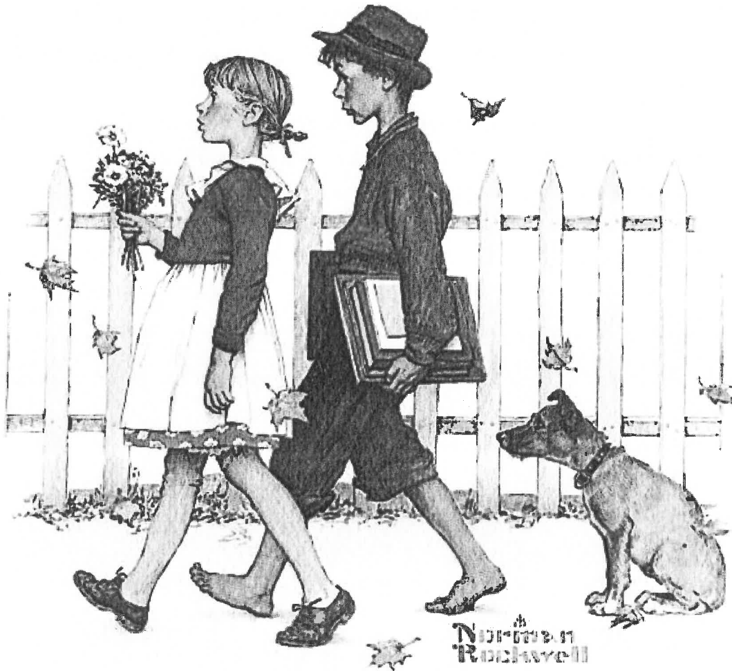
"Walking to School," Norman Rockwell (1976)