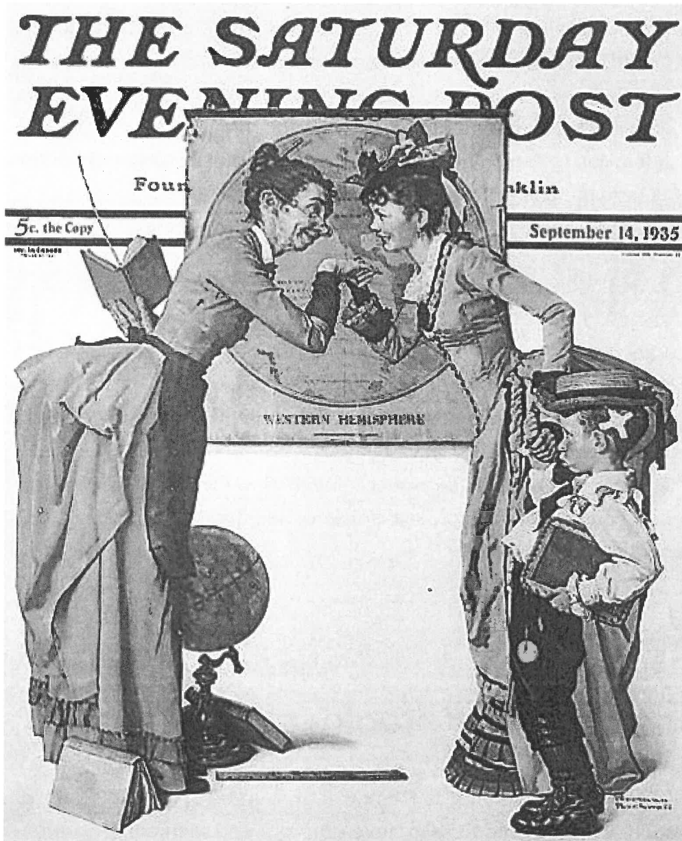
"First Day of School," Norman Rockwell (Saturday Evening Post: September 14, 1935)