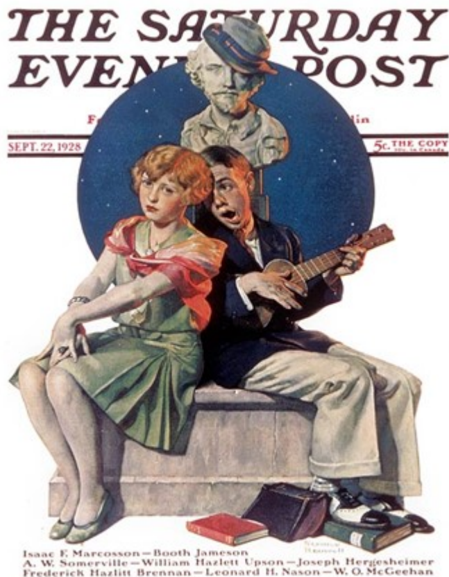
“Serenade,” Norman Rockwell (Saturday Evening Post: September 22, 1928)